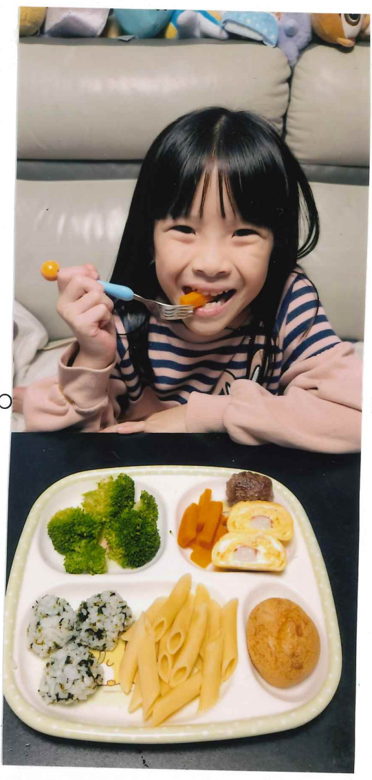
(Stick the photo of your healthy meal here.)

ii. Prepare the healthy meal that you have designed (on Pg. 3) with your parent. Take a photo of your healthy meal when you are tasting it. Stick the photo in the box.